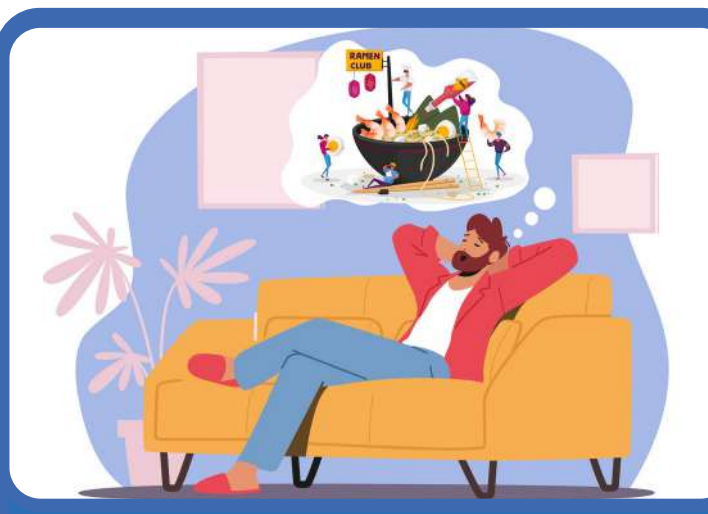
If you can dream it, you can make it!!! (as long as it is not illegal, offensive, or death-defying!)

Find a couple student pals to fill out your committee and we will help you figure out everything else!